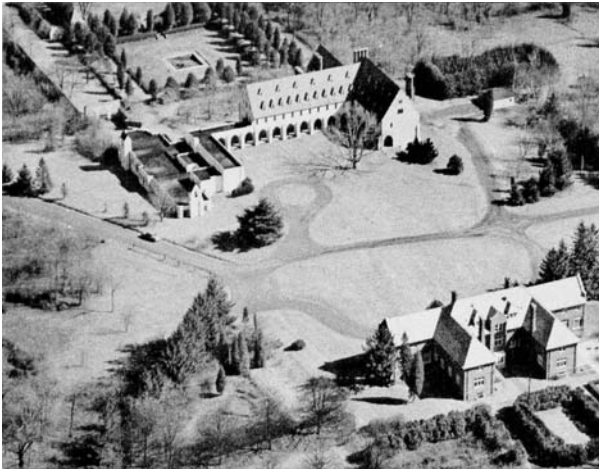
Historic Aerial View c. 1915