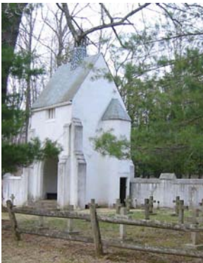
Chapel at Cemetery